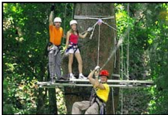
Visitors queue up for the Mahogany Park canopy tour in Costa Rica. (The Original Canopy Tour)

For now, you can zip through tropical rain forests or jungles, over an extinct volcano or within view of waterfalls. It requires only a leap of faith.